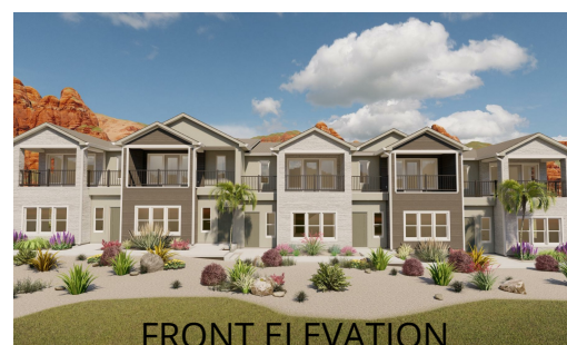
FRONT ELEVATION RENDERING

With 3 beds and 2.5 baths, The Sierra Vista two-story townhome offers up style and function in a modern appeal. On the main floor, you and your family can relax in the family room and watch TV to cook and dine in the kitchen and dining nearby, thanks to the open concept design. The kitchen provides a spacious walk-in pantry and additional counter space with a kitchen island for easy prep and cooking. Everything from a coat closet at the entry to the mudroom off the garage, provide additional storage space throughout. You're sure to love all of the upstairs living space, with a loft for turning into a study, lounge, or playroom, to the owner's bedroom featuring an owner's bath and large walk-in closet including a window.