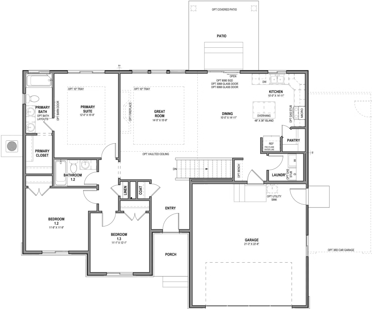
LEVEL 1 MARKETING PLAN