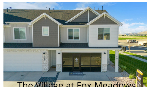
The Village at Fox Meadows Townhome Model

Living in Smithfield, UT is the ideal spot for those seeking small-town living without sacrificing proximity to local grocery stores, parks, schools, and close access to Logan City. In addition, The Village at Fox Meadows Townhome amenities include a community pool and clubhouse, perfect for gathering with friends, family and neighbors to make lifelong memories.