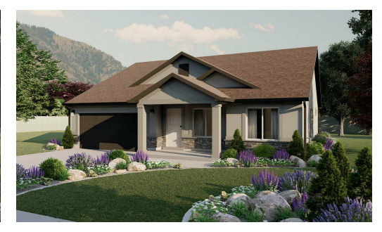
Craftsman Farmhouse Traditional w/Stucco