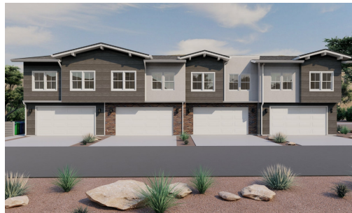
Desert Territorial, Rear

*Visionary Homes reserves the right to change prices without notice. Approximate square footage and options shown in plan may not be included in base price.