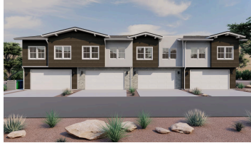
Desert Territorial, Rear

*Visionary Homes reserves the right to change prices without notice. Approximate square footage and options shown in plan may not be included in base price.