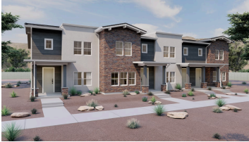
Desert Territorial, Front

Ask about the $10,000 incentives on this home!