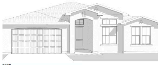
Lot 78 Exterior, Spanish Mission