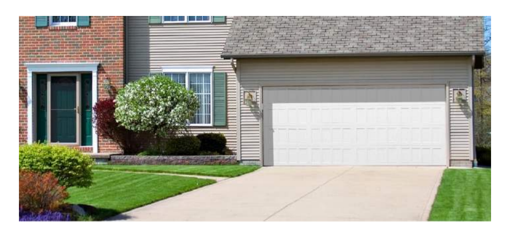
RECESS SHAKER W/ NO WINDOWS & NO HARDWARE