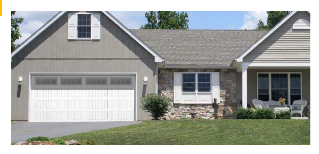
STAMPED BEAD BOARD W/ MADISON WINDOWS