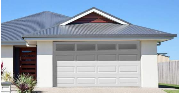
RAISED LONG PANEL W/ CLEAR LONG WINDOWS