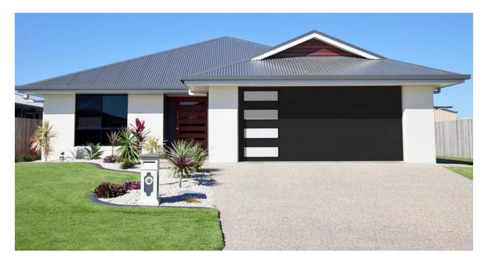
Windows to the Left