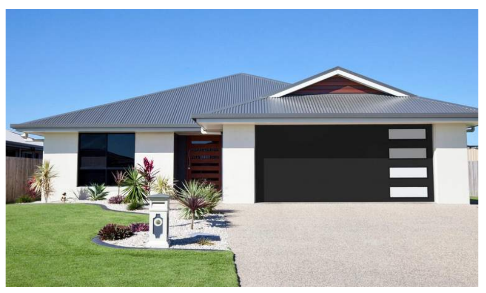
Windows to the Right