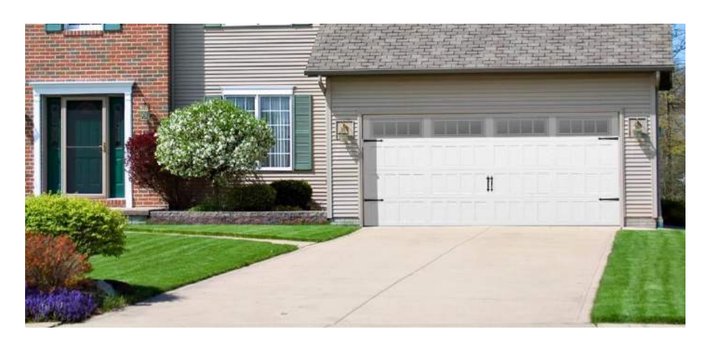
RECESS SHAKER W/ MADISON WINDOWS & BLACK HARDWARE