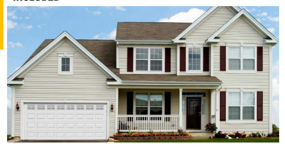
Short Panel Raised w/ Stockton Windows